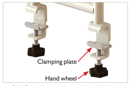
5. I. I Sliding clamping plates onto hook brackets

Slide the clamping plates onto the hook brackets and screw the hand wheels in place. Note the correct orientation of the clamping plates.