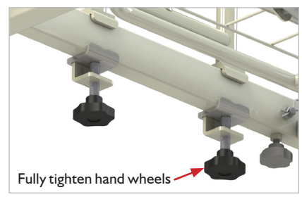
5.1.4 Tightening hand wheels

Fully tighten both hand wheels, ensuring the grab handle is securely fastened and the clamping plates are correctly hooked around the bed frame.