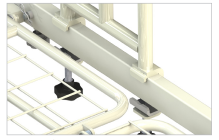
5.1.2 Hook grab handle onto bed frame

Loosen the hand wheels sufficiently to allow the hook brackets and clamping plates to fit around the side tubes of the bed frame.