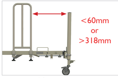
5.1.3 Grab handle positioning

IMPORTANT! For safety reasons, it is critical that the distance between the grab handle and the bed end is less than 60mm or greater than 318mm.